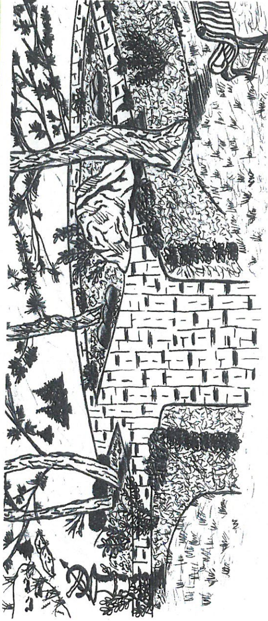
Drawing by: M. Greco